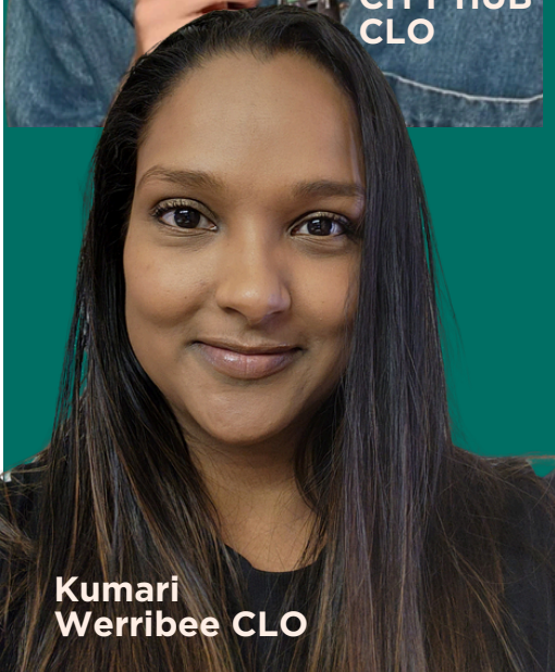
Kumari Werribee CLO